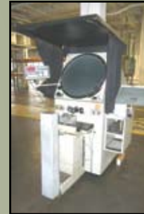
24" SPI Mdl. PO-600 Comparator