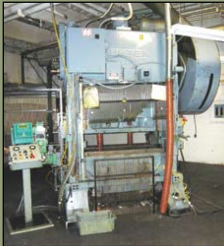
100-Ton Minster Mdl. P2-100-48 High Speed Press