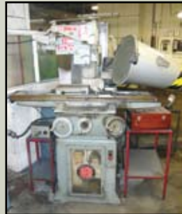
6" x 18" Reid Mdl. 618H Surface Grinder, with Diaform Dresser