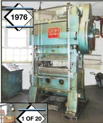
▼ 60-Ton Oak Mdl. 42LP-60LAM High Speed Press