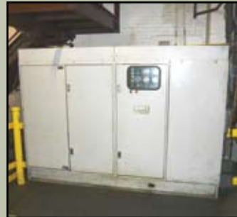
150HP Joy Mdl. 690 Air Compressor