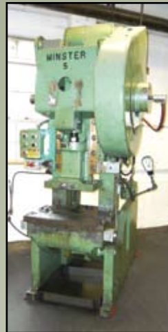
45-Ton Minster #5 OBI Flywheel Type Press