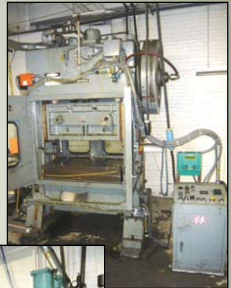
▲ 45-Ton Minster Mdl. P2-45-48 "Piecemaker" High Speed Press