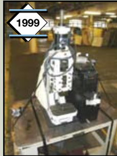
Schmidt Mdl. 34-162-99 Pneumatic Press

Over [20] Torit Dust Collector Units , most Mdl. 64 type