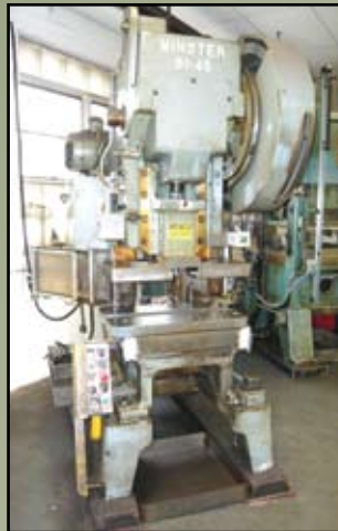
45-Ton Minster Mdl. B1-45 High Speed Press