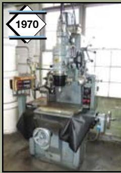
Moore #3 Jig Grinder