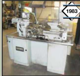
Hardinge Mdl. TFB/HLV-H Lathe