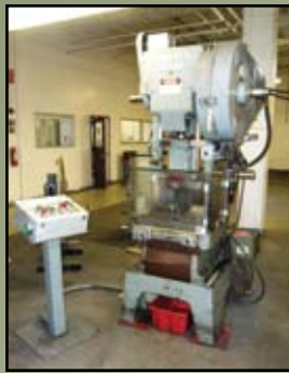
32-Ton Minster Mdl. B1-32 High Speed Press