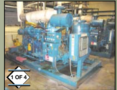
Quincy Mdl. QSS-750W/110 750-CFM Compressors