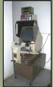
14" Mitutoyo Mdl. PH350H Comparator