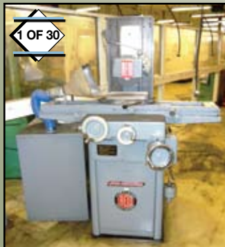
6" x 18" Reid Mdl. 618H "Rollerway" Surface Grinder

Holiday Inn GWB ..... 877.531.5084 Holiday Inn ..... 800.345.8082