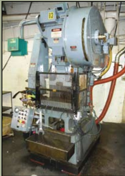
▲ 32-Ton Minster Mdl. B1-32 High Speed Press

Featuring: [20] High Speed & OBI Minster & Oak Presses • [20] Nilson & Sleeper and Hartley 4-Slides (New as 1982) • [30] Reid Surface Grinders • Comparators • Toolroom Machinery • Moore Jig Grinder • Lab Equipment • Compressors • Large Quantity of Shop Related Equipment