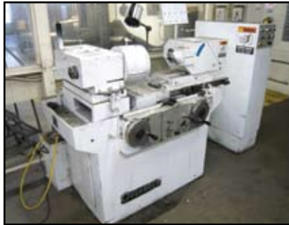
Overbeck Mdl. 3501 ID Grinder

Presorted First-Class Mail U.S. Postage PAID Minneapolis, MN Permit #3723