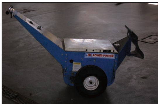
Nu-Star Electric Power Pusher