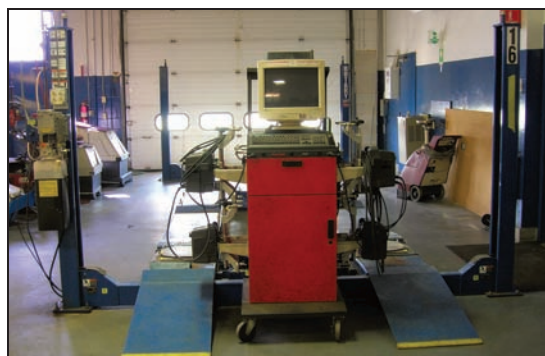
Hunter Model P411 - 4 Wheel Electronic Alignment with Rotary 10,000 lb. cap. Extended Bed Lift