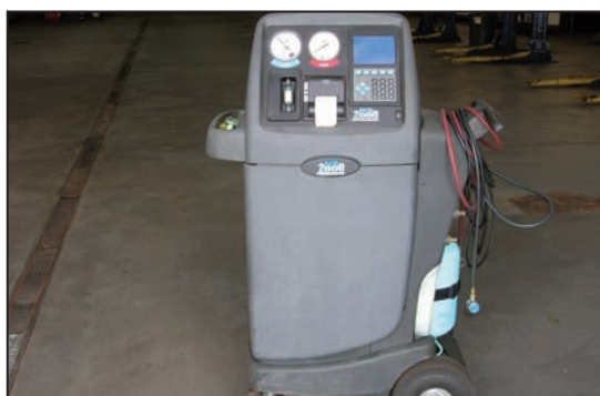
Robinair Model ACR 2000 Refrigerant Recovery/Recharging Unit