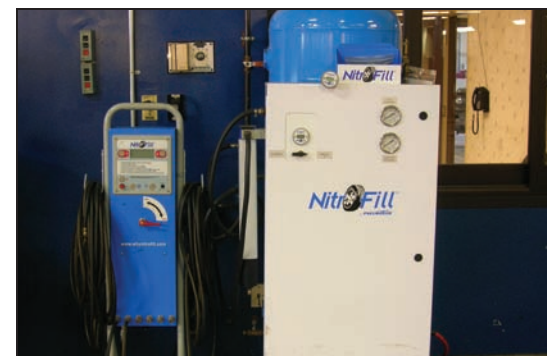
Pneumatech NitroFill Tire Fill System