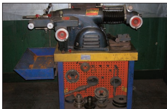
Ammco Model 4000 Safe-Turn Brake Lathe (1 of 2)