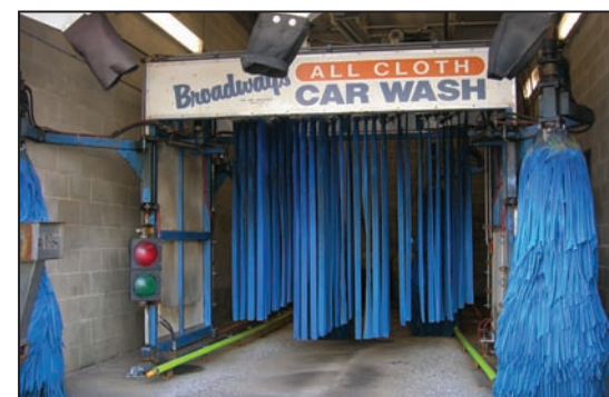
Broadway Model 7778 Automatic Brushless Car Wash (Refurb. 2007)