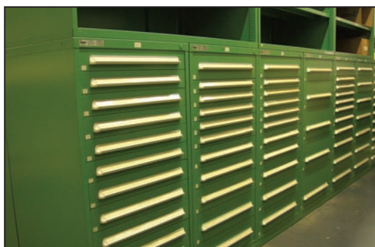
Partial view of Stanley-Vidmar cabinets (42 Total)