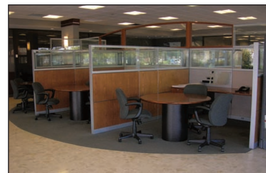
Cherry Wood, Glass & Metal Modular Workstations

Equipment to Include: Hunter - Model P411 electronic 4 wheel alignment system w/Rotary 10,000lb. cap. extended lift, 14-Rotary 7,000lb. cap. twin-post lifts, Rotary 10,000lb. cap. twin-post lift, New 2005, Broadway - Model 7778 automatic car wash, Refurbished 2007, Pneumatech - Nitrofill system, Lujan-Sniper - Model 5404 optical headlight aiming system, Ammco - Model 740 overhead tire mounter, NuStar electric power pusher, BG Systems power steering, brake service, & transmission flushers, Robinair - Model ACR2000 refrigerant recovery/recharging unit, Snap-On AVR tester, 2-Ammco - Model 4000 brake lathes, Kwik-Way valve grinder, Kent-Moore strut compressor, ass't. jacks, jack stands, engine stands, engine