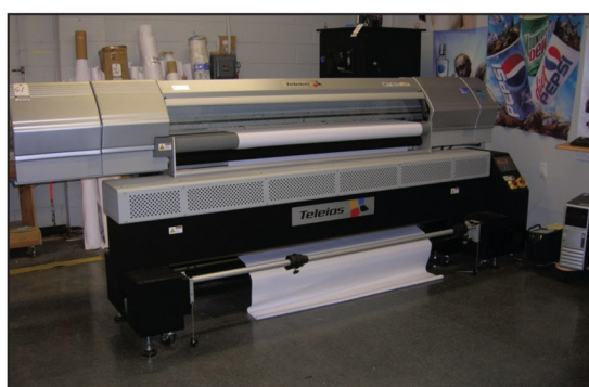
Teleios - D-gen 740TX/V8C Digital Textile Printer, New 2007