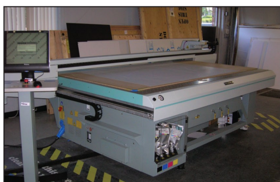
Fuji - Acuity HD-2504 Digital 4 color UV Flat Bed Printer, New 2008