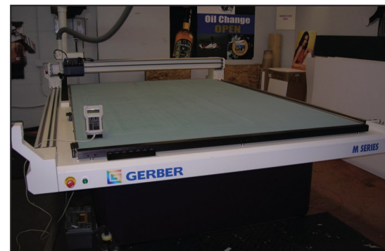
Gerber - M300GS 75"x122" CNC Flat Bed Cutter, New 2008