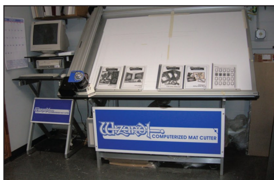
Wizard - Computerized Mat Cutter