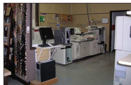
Noritsu - Photo Processing Equipment

Digital Print & Cutting Equipment: Fuji - Acuity HD-2504 digital 4 color UV flat bed printer, New 2008, Gerber - M300GS 75"x122" CNC flat bed cutter, New 2008, Teleios - D-gen 740TX/V8C digital textile printing machine, New 2007, 2-Seiko - IP-6600 Color Painter 64S vinyl printers w/dryers, 3-HP - DesignJet 5000-PS 60" inkjet printers, Epson - Ultra Chrome K3 Pro9800 48" inkjet printer