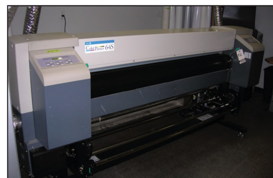
Seiko - Color Painter 64S, Vinyl Printer w/Dryer (1 of 2)