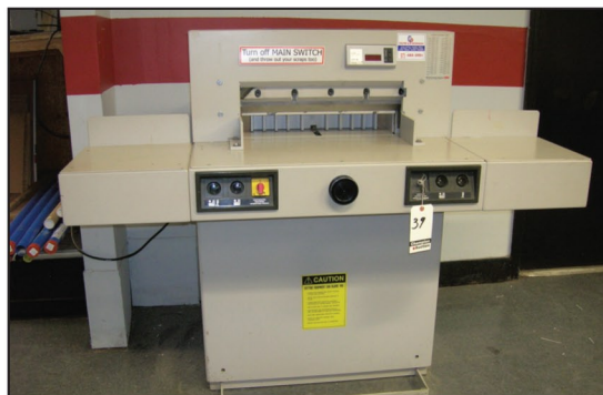
Triumph - Model 5221-90 - Power 20" Paper Cutter