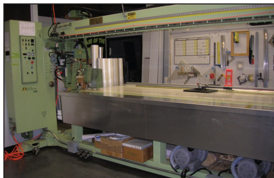
Miller - Weldmaster Model 112SB Vinyl Welder

Sale Date: Wednesday, September 30, 2009 - Starting at 10:30 A.M. Inspection: Tuesday, September 29, 2009 - 9 A.M. to 4 P.M. & Morning of Sale